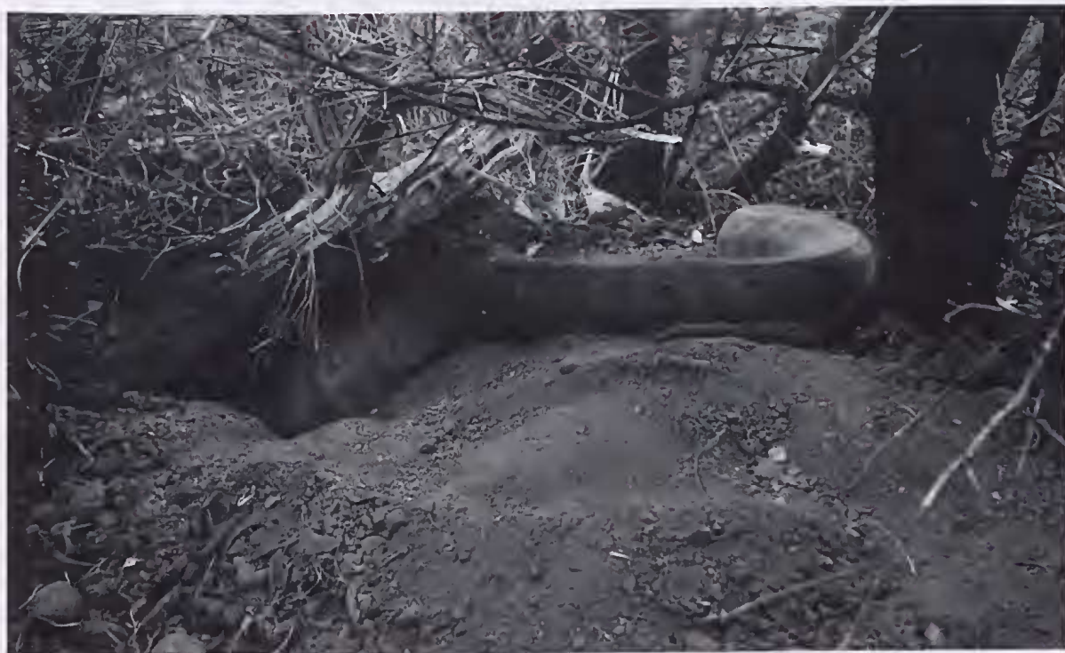
FIG. 2: An adult male woma python Aspidites ramsayi excavates a large burrow in alluvial clay soil.

camouflage. The observations reported here were all recorded on still camera and several behaviours were also captured on motion camera. A genetic tissue sample of each radiotracked woma python is held at the Queensland Museum.